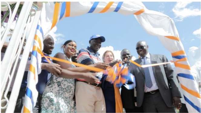
Representatives from dfcu Bank, The Agriculture Development Center in Lira District during the announcement of the partnership with Rabobank which will support Farmer Based Organisations across the country.

Share on Facebook Tweet on Twitter Like 1 Tweet