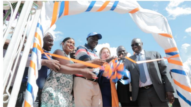
Representatives from dfcu Bank, The Agriculture Development Center in Lira District during the announcement of the partnership with Rabobank which will support Farmer Based Organisations across the country